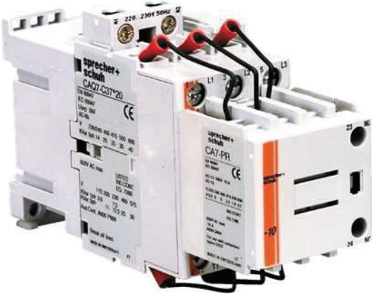
Representative Photo Only (actual product may vary based on configuration selections)

Contactor 15KVaristor Capacitor 240 auxiliary 1N/O 1N/C