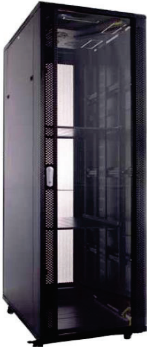
Reference image only

Rack Technologies RTX Free Standing Cabinets are a perfect solution for Small to medium business, low density commercial and communication room environments. RTX Cabinets are supplied fully assembled to provide cost effective and efficient rack equipment installations and maintenance. With multiple door options and a list of standard "extras" including shelves, Power rails, Fans and cable management systems the RTX series outperforms any competitor offer.