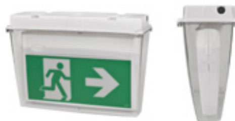
AQUA LOCK-W (IP65) with LED Stingray