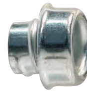
LT - F FERRULE Electro galvanised steel ferrule designed to protect cables against sharp edged conduits