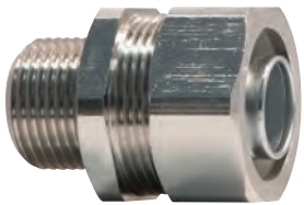
LC - B (IP66/67/68) External Male Thread Straight Multi part compression fitting with a nylon seal Available in Zinc Plated Steel, Nickel Plated Brass (B) and 316 Stainless Steel (SS)

LT conduit is used extensively in the machine tool and other industrial environments where flexibility is necessary or where vibration or movement must be absorbed.