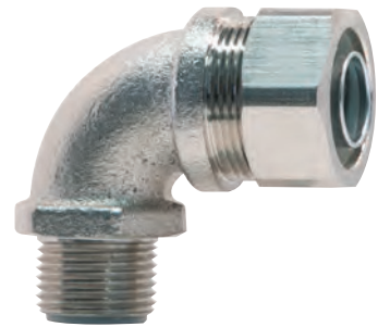
LC-90 - B (IP66/67/68) External Male Thread 90 degree bend Multi part compression fitting with a nylon seal Available in Zinc Plated Steel, Nickel Plated Brass (B) and 316 Stainless Steel (SS)