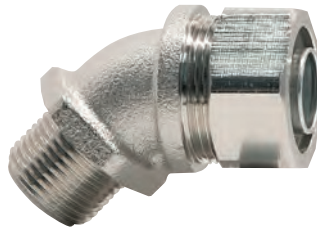
LC - 45 - B (IP66/67/68) External Male Thread 45 degree bend Multi part compression fitting with a nylon seal Available in Zinc Plated Steel, Nickel Plated Brass (B) and 316 Stainless Steel (SS)