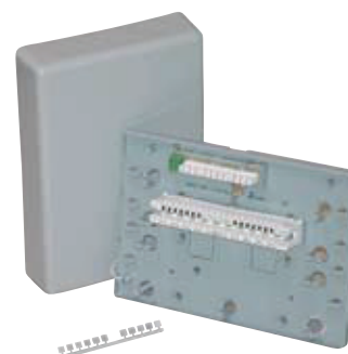
Final Distribution Point – with Earth 10-pair

Final Distribution Point for use beyond the network boundary. Shallow lid does not permit overvoltage protection magazines.