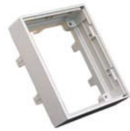
Attached Frame, Size I

Used for increasing the depth of a Kronection Box to allow for the installation of overvoltage protection components and making it suitable as an MDF enclosure.