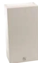
Jumperable Frame Cover, 11 way

Provides adequate depth for overvoltage protection magazines or test cords when fitted into the modules. Provision for record book storage. Comes with a lock and key. Cable entry points on all four sides. Suitable for both Profil® and Backmount Jumperable frames. Suitable for MDF enclosure.