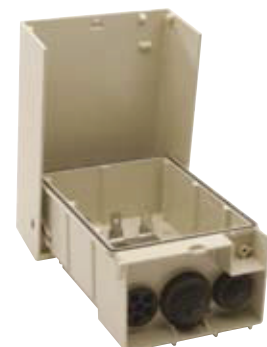
Kronection Box A30

The A30 Kronection Boxes are designed to accommodate up to three LSA-PLUS® modules. The Box can be mounted directly on a wall or pole. The cover has a special hinge, which keeps it open during installation work so that it functions as protection against the rain. Suitable for MDF enclosure.