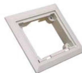
Levelling Frame, Size I

Used when flush mounting a Kronection Box.