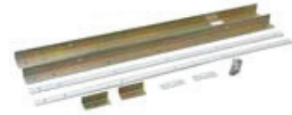
IMDF Mounting Kit

Mounting kit for an IMDF. Suits both Profil® and Backmount versions. Includes upper and lower supports and kick rails to accommodate 5 vertical kits. One required per 5 vertical kits.