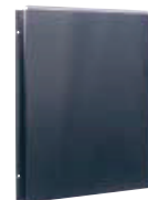
Record Book Holder

Used to hold 1000-pair Record Book. For surface mounting inside telecommunication closets.