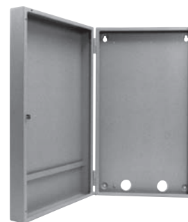
Distribution Box, unequipped

For internal use as a building distributor or floor distributor at or beyond the network boundary. Comes complete with mounting hardware for 2 or 4, 27 way frames. Frames must be purchased separately. Suitable for MDF enclosure.