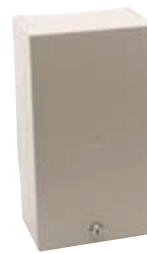
Jumperable Frame Cover 11 way

This cover provides adequate depth for overvoltage protection magazines or test cords when fitted into the modules. Provision for Record Book Holder. Comes with lock and key. Cable entry points on all four sides. Suitable for both Profil® and Backmount 11 way jumperable frames. Suitable for MDF enclosure.