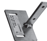
MDF Conversion Bracket

Used to upgrade old MDFs to ADC KRONE Backmount frames. Only suits 55 and 66 way frames.