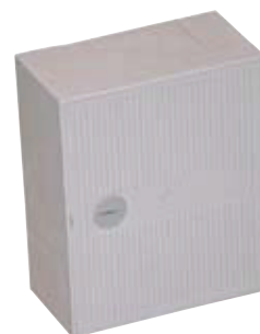
Kronection Box, Size I

These boxes are not waterproof. Backmount Frame sold separately. Not suitable for MDF enclosure unless Kronection Box Attachment Frame is also used.