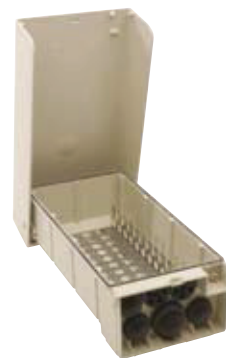
Kronection Box A100 without lock

The A100 box is designed to accommodate up to ten LSA-PLUS® modules. The box can be mounted directly on the wall or on a pole. The cover has a special hinge, which keeps it open during installation work.