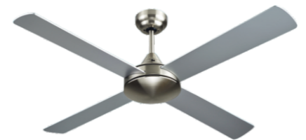
Brushed Nickel with brushed silver timber blades (Product code: A2324)