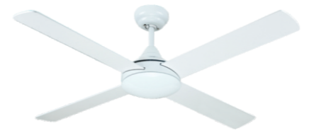
White with white timber blades (Product code: A2323)