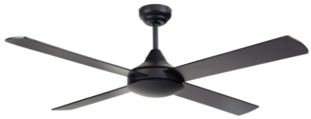
Matt Black with matt black timber blades (Product code: A2322)