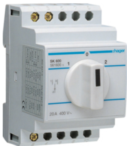
Selector switch non spring ret