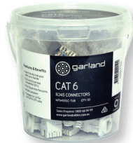
Tub - 50 Pack