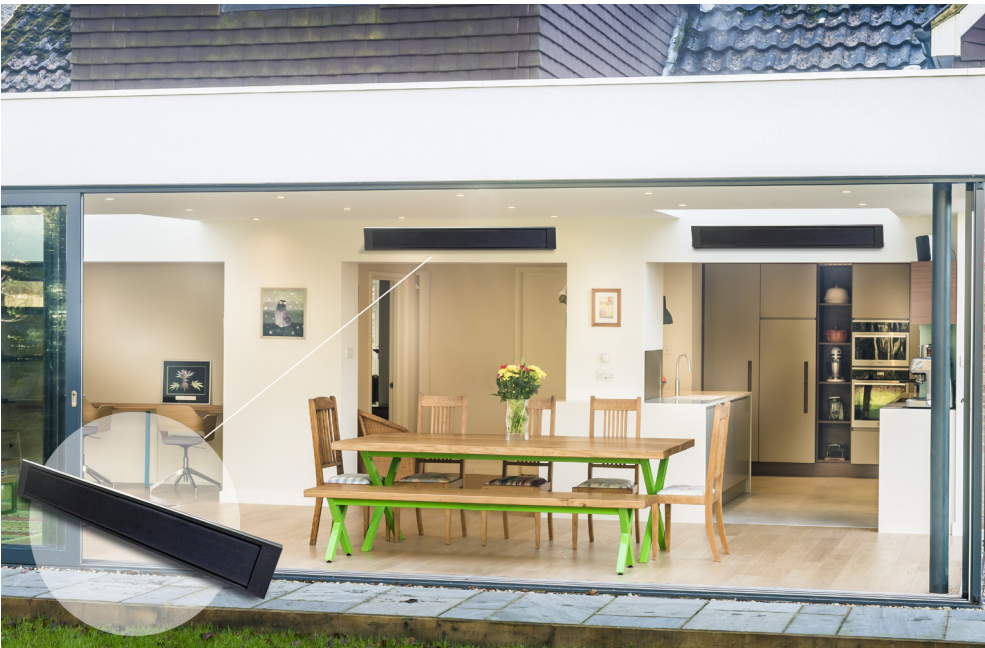
Above Comfortline Terrace Heater Front and back cover are Comfortline Excel in black & white