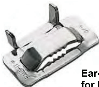
Ear-Lokt Buckle for Uncoated 316SS Band