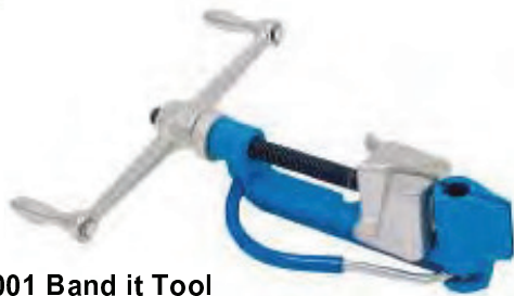
C001 Band it Tool