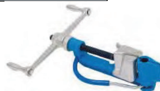
C001 Band it Tool

Band-It Tool for bands 6mm – 20mm wide Weight: 2.0 Kg