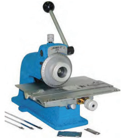
ID Tag Imprinter Tool