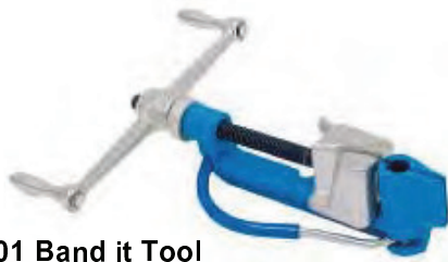
C001 Band it Tool

Click on the image to open the instruction manuals: