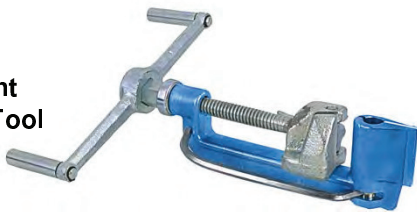
G402 Giant BAND-IT® Tool