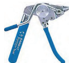
CO75 Light duty Band it Tool

Band-It Bantam Tool for Light Duty Banding only Weight: 1.2 kg