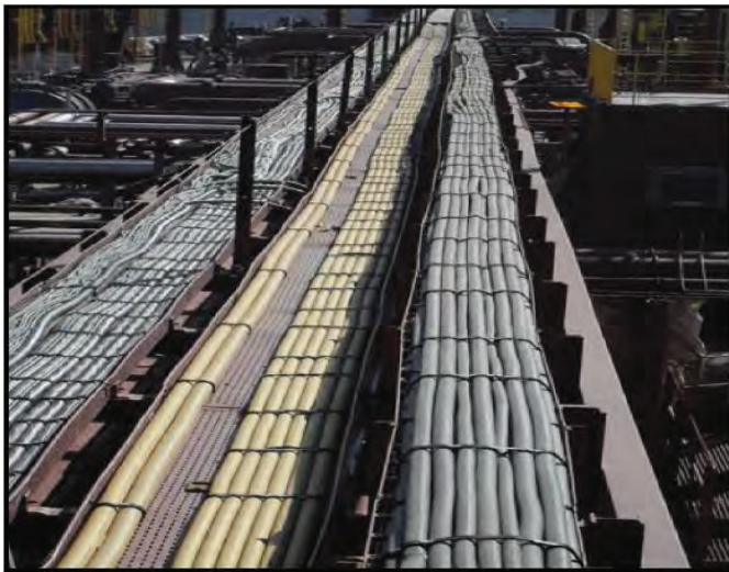
Used in cable management applications to reduce the risk of cutting or abrading cable