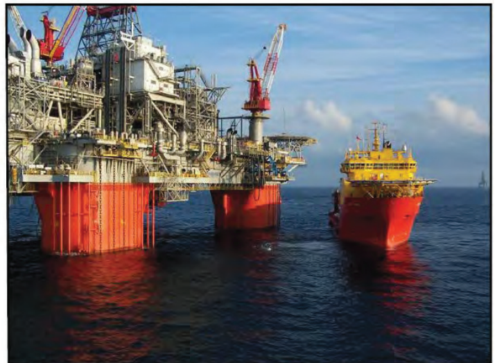
Ball-Lok™ corrosion resistance is ideal for harsh marine environments