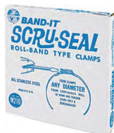
BAND-IT® Scru-Seal Clamps