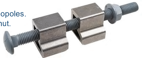
BAND-IT® Bolt clamps