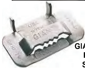
GIANT Ear- Lokt Buckles For BAND-IT® Giant Stainless Steel Band