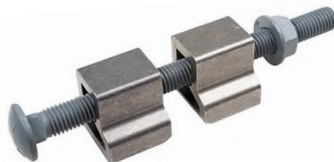
BAND-IT® Bolt clamps

Starting a project and needing BAND-IT® stock? We ship nationwide and are able to send express! Have a question? Call our friendly team (03) 9547 5833 Email us: info@band-it-australia.com.au or visit our Website: www.band-it-australia.com.au