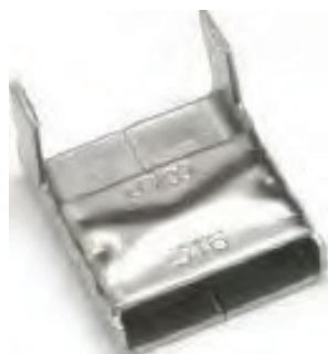
Stainless Steel Clip (with extra height) for Coated 316SS Band