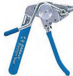
C075 Light duty Band it Tool