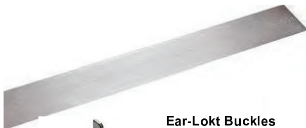
Ear-Lokt Buckles In various widths For BAND-IT® 201 Stainless Steel Bands.