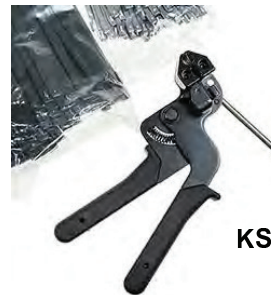
KS652 Ball Lok Tie Tool