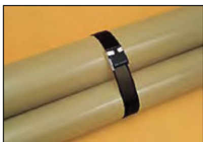
316 Coated Stainless Steel Band

The Coated 316 Stainless Steel is designed to eliminate damage and protect cables when bundled.